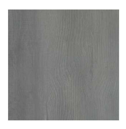
Hungary WUD 2700 SST