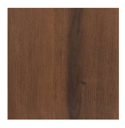
Tanzania WUD 2702 SST