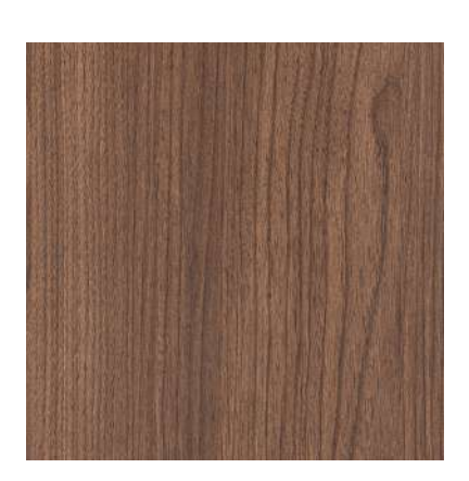
Balkan WUD 2723 SST