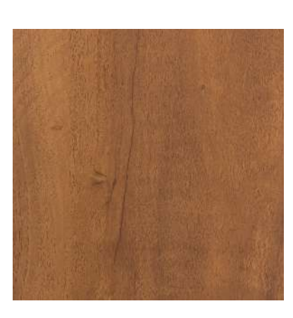
Rochester WUD 2714 SST