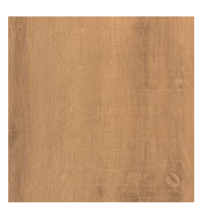
Gante WUD 2711 SST