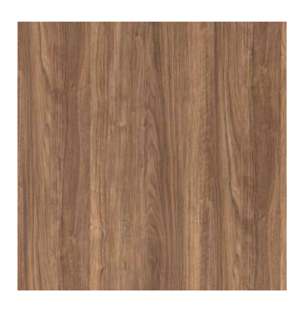
Beverly WUD 2787 SST