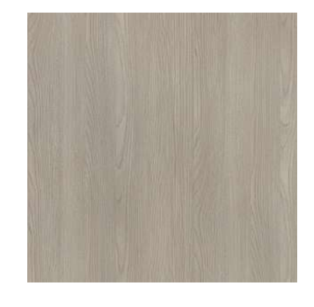
Miami WUD 2728 SST