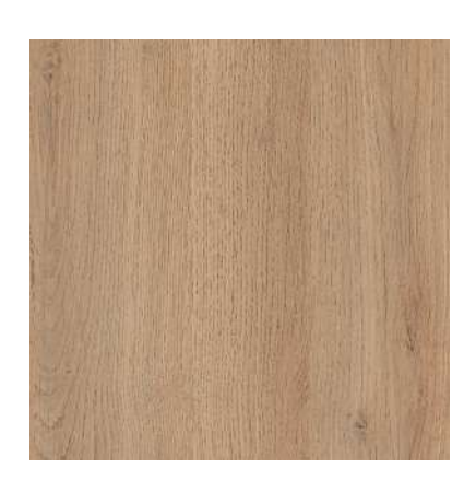
Alberta WUD 2773 SST