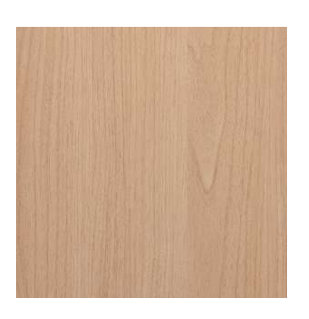
Notre - Dame WUD 2721 SST