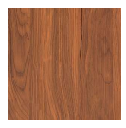
Ohio WUD 2712 SST