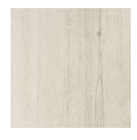
Arizona WUD 2701 SST