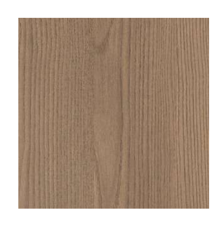
Virginia WUD 2783 SST