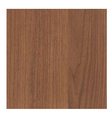
Indiana WUD 2722 SST