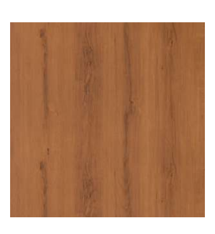
Myanmar WUD 2703 SST